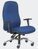
▲ High Back Swivel H1080–1180 W810 D620 SH470–570mm 660