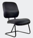
▲ Cantilever Chair H940 W580 D730 SH465mm 664