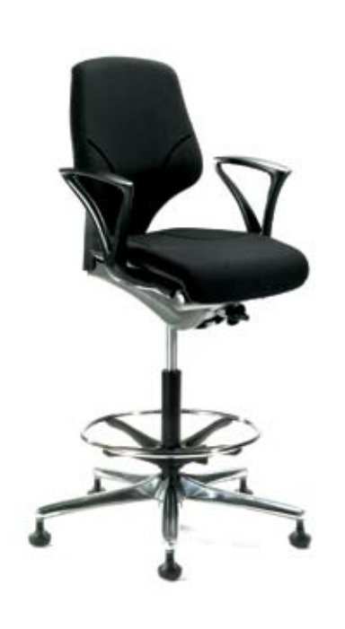
64-7078 Midback Swivel Armchair (with extra height and footring)