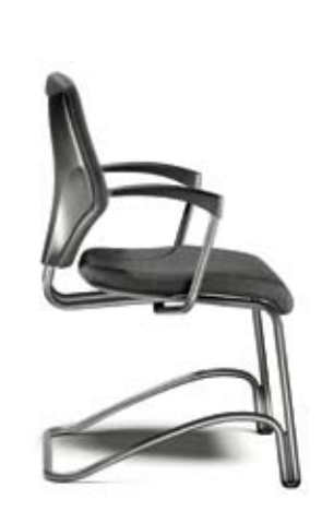
64-7002 Midback Cantilever Armchair