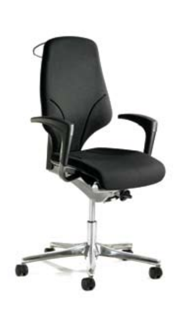
64-7578 Highback Swivel Armchair