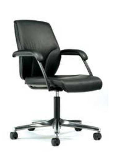
64-9279 Conference Armchair