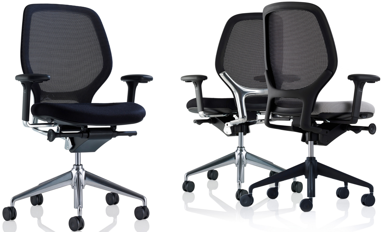
Top – ARA-MBA & ARA-EBA, Bottom – ARA-MBA